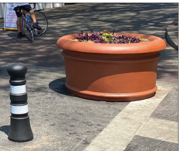
Dirty streets, double-wide bike lanes, and weak container plantings contribute to a sense of disrepair.

non-profits like Santa Barbara Beautiful, which grants money for tree replacements for the city.