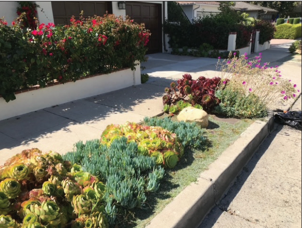
Many private business have provided landscaping and perked up tree wells.

a significant build-up of grime, but organization and results are lacking. The city has purchased Zambonitype street cleaners and has been saying for months that they will pick up the pace of cleaning, including side streets and sidewalks, which have not been cleaned in years. The sidewalks smell of urine and are sticky. The police department is working with a social worker, and they have purchased more bikes and added more street patrols - which have helped significantly with serving people experiencing homelessness. But for clean up, even volunteers such as The Downtown Organization and the South Coast Chamber have hosted just three clean up days in two years, and these citizen-powered volunteer days do little more than pick up trash. Deep dive cleaning, complete with the required water reclamation, needs to be done by the city - and it isn't being done in any adequate way. Attention also must be paid to the nearly 1,000 empty tree wells in the downtown area.